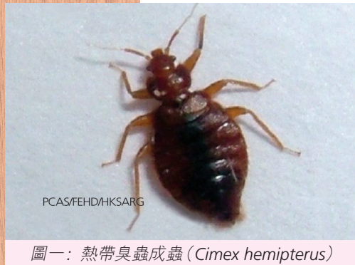
圖一：熱帶臭蟲成蟲 ( Cimex hemipterus )

臭蟲屬於半翅目昆蟲。對人類造成滋擾的臭蟲有兩種，牠們分別是溫帶臭蟲( Cimex lectularius )及熱帶臭蟲( Cimex hemipterus )。前者遍布全球，後者則主要見於熱帶地區。兩種臭蟲在本港都可以找到。