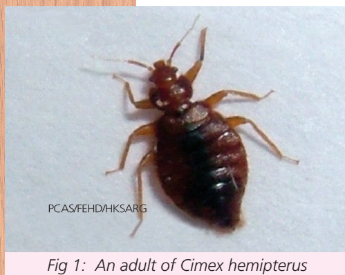
Fig 1: An adult of Cimex hemipterus

Bedbugs are insects belonging to the order, Hemiptera (半翅目). There are two species of bedbugs causing nuisance to humans, namely the common bedbug, Cimex lectularius (溫帶臭蟲), and the tropical bedbug, Cimex hemipterus (熱帶臭蟲). The former is distributed worldwide while the latter is mainly found in tropical regions. Both species have been recorded in Hong Kong.